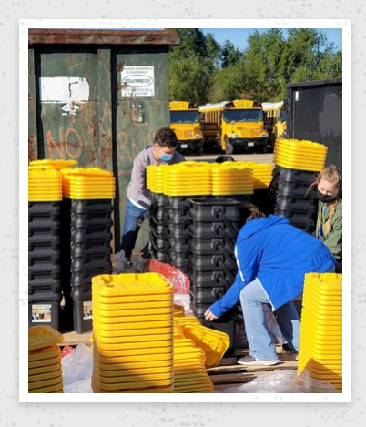
NHS Students setting up to fill Classroom Emergency Buckets

Emergency Response Buckets for the classrooms and Emergency Response Bags for the buses were assembled by the Brazoswood National Honor Society Members. The items included in the emergency kits are flashlights, whistles, Neon vests, First Aid Kits and Emergency blankets. 400 "Go buckets" were placed in classrooms and 73 "Go bags" were placed in the new bus fleet. The Buckets and bags were distributed over the holiday break. Phase 2 of the project will be to deploy Stop the Bleed Kits to the remaining 700 classrooms in the coming weeks.