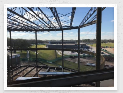
Brazoswood Phase 3 - High School