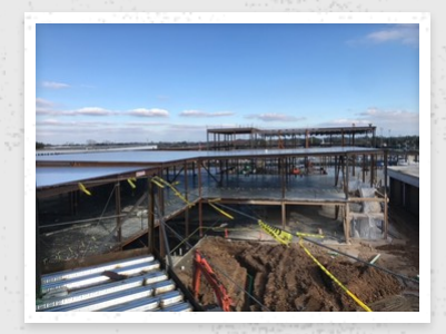
Brazoswood Phase 3 - High School