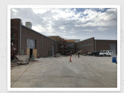
Brazoswood Phase 2 - CTE Building