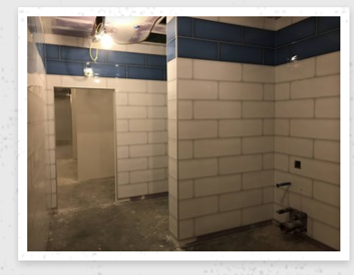
Brazoswood Phase 2 - CTE Building