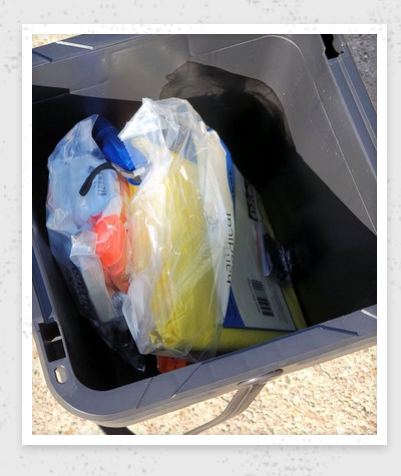
Supplies to fill Emergency Buckets and Bags